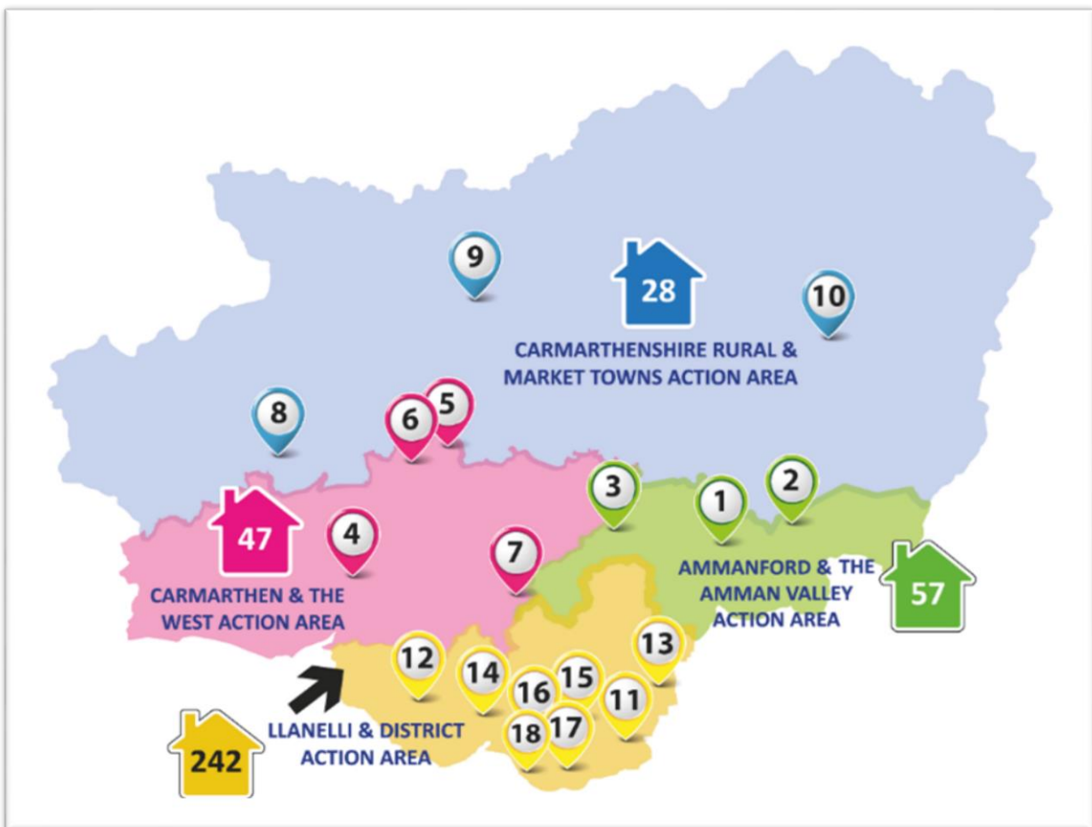
MAP 2 – 374 Council homes to be delivered in the first three years

During the first three years of the programme over 300 new Council homes will be built with a total investment exceeding £53m. Map 2 below shows where these homes will be built