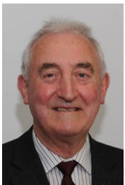
Cllr. Alan Speake Carmarthen West (Plaid Cymru)