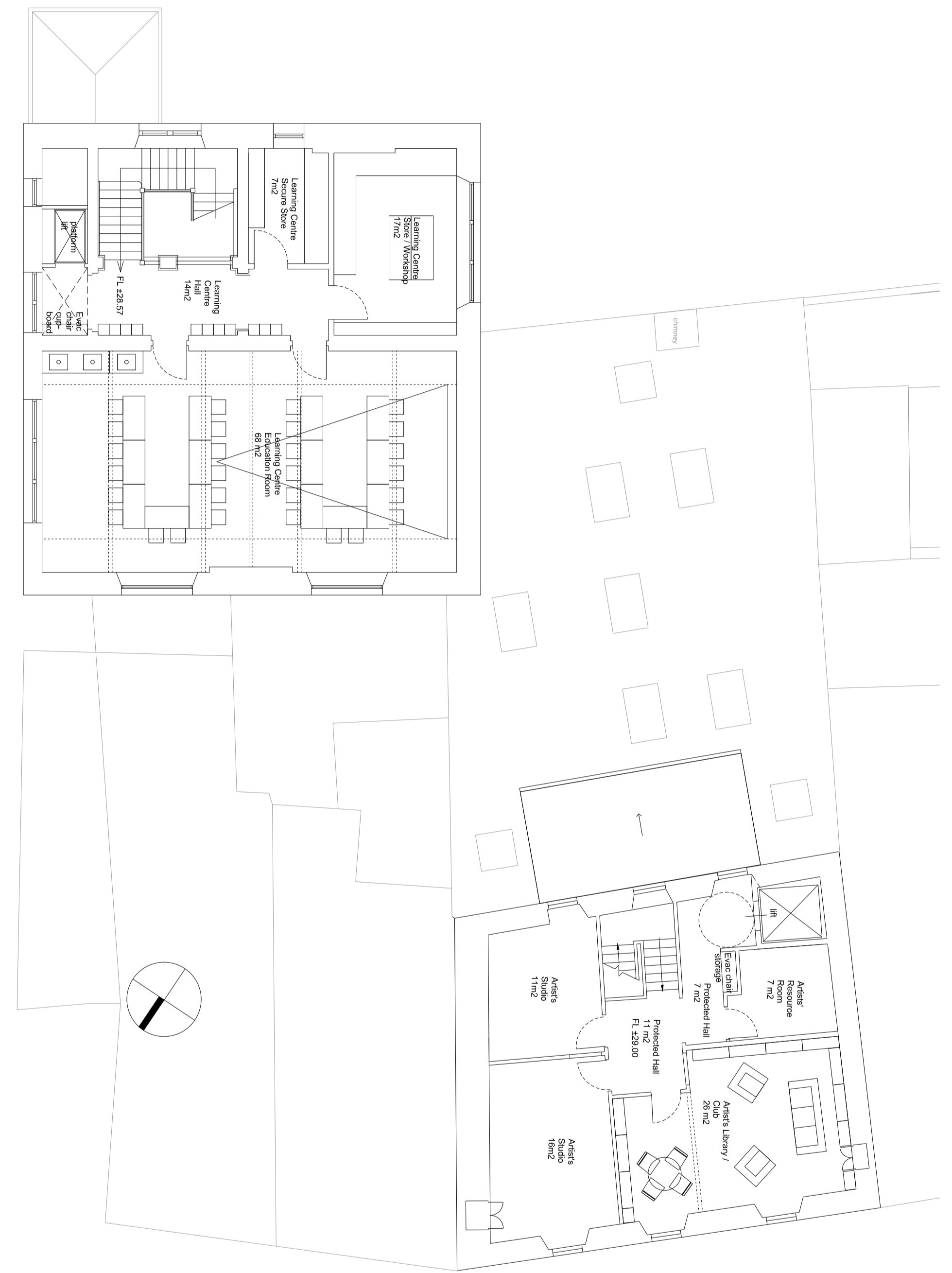
1 PROPOSED GROUND FLOOR PLAN SCALE 1:100 @ A1