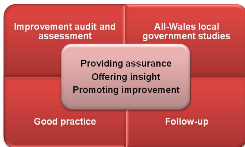
Exhibit 3: Components of my performance audit work