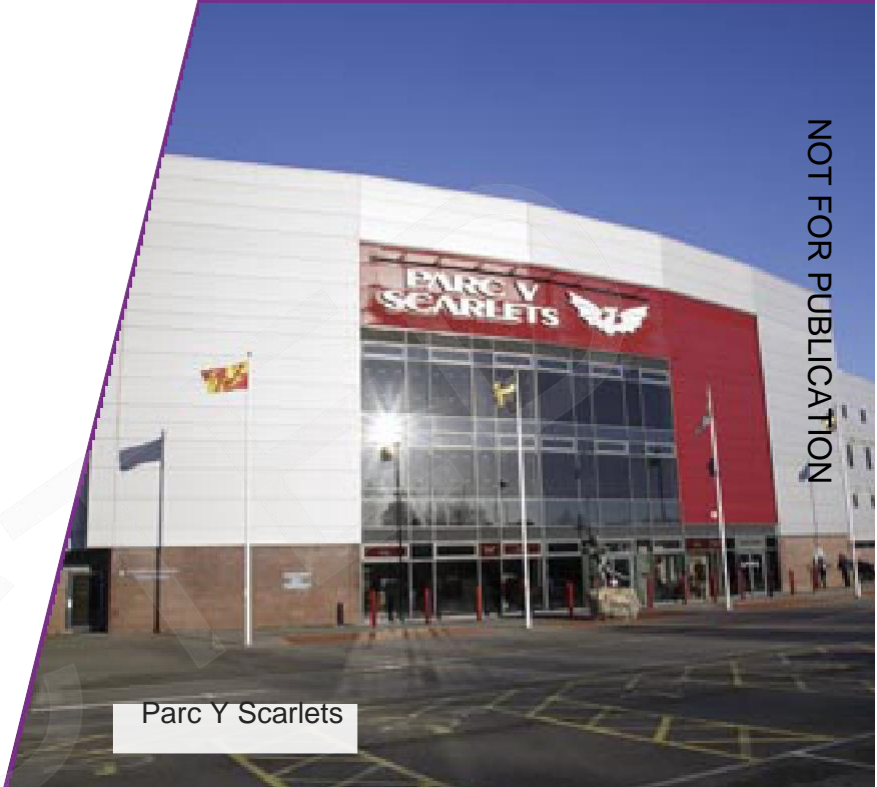
Parc Y Scarlets