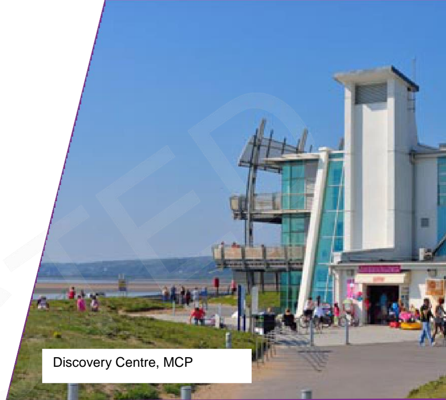
Discovery Centre, MCP

We've also submitted an application under the UK Government Community Renewal Fund to develop future project proposals. These will include; improvements to the Llanelli Good's Shed, placemaking at Pentre Awel, Tyisha and Llanelli Town Centre which will encompass a range of realm improvements, cycling pedestrian infrastructure, environmental enhancements and improvements around accessibility for Llanelli train station. All of these will create a sense of place, regenerate historic buildings and strengthen accessibility and connectivity between the Town Centre, Pentre Awel, coastal path and Tyisha.